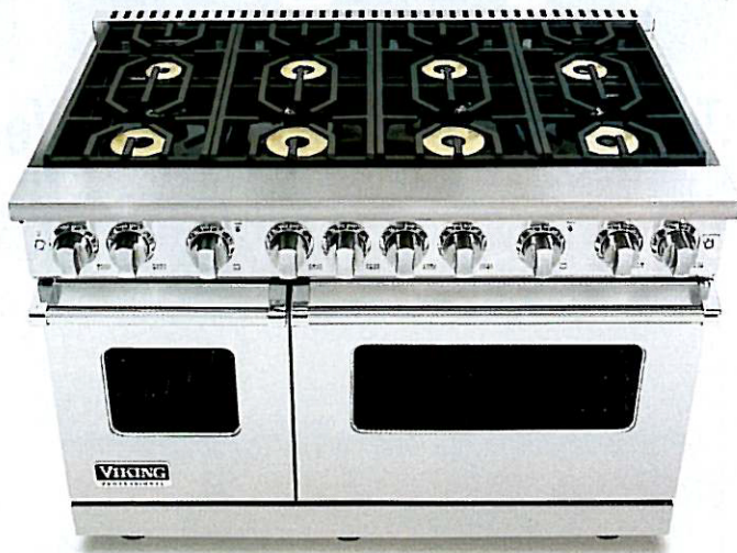
Viking's Professional 7 Series Range will launch in December and be featured at KBIS. The range will be available in 36- and 48-in. widths in both gas and dual-fuel models, and a ViChrome thermostatically controlled chrome griddle option will be available in January 2014.